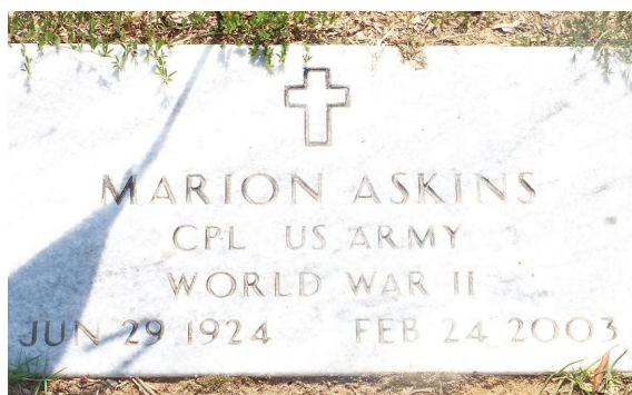
Added by: Jason Cockfield